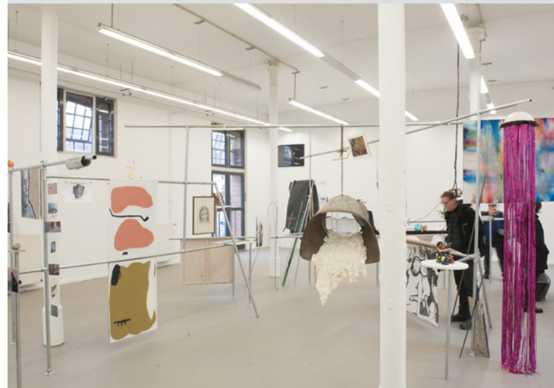
Presentation of works of a painting class during Rundgang 2014.