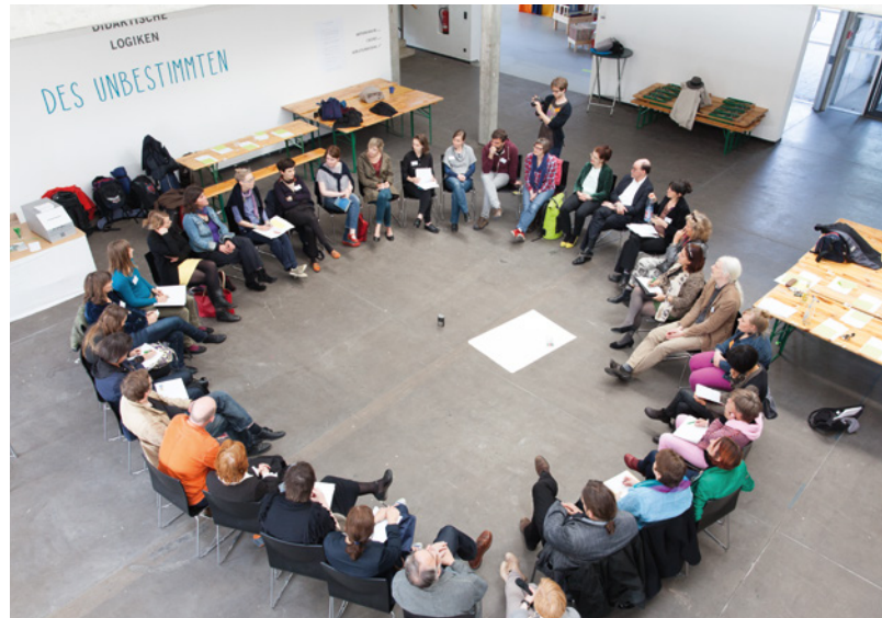
Workshop during a conference on art didactics.

The University of Fine Arts Münster has the right to award doctorates for the academic subjects represented by full-time professorships (see above). Our Ph.D programme is characterised by its intimate connection with the University’s artistic and cultural activities in both research and tuition.