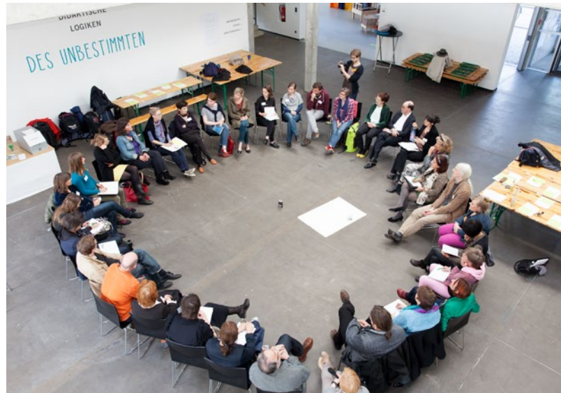
Workshop during a conference on art didactics.

The University of Fine Arts Münster has the right to award doctorates for the academic subjects represented by full-time professorships (see above). Our Ph.D programme is characterised by its intimate connection with the University's artistic and cultural activities in both research and tuition.